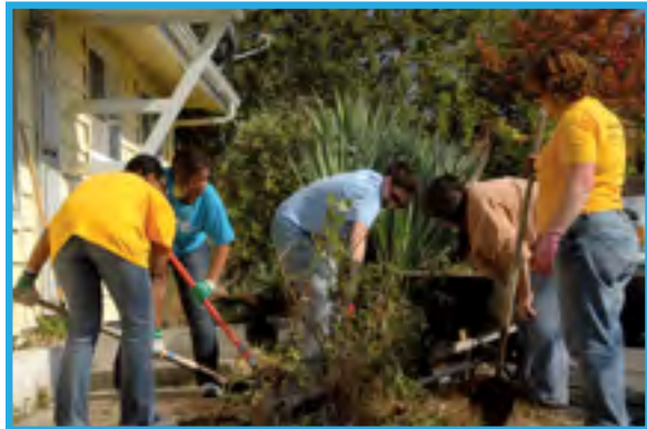
Our Associated Ministries Staff's special project giving back to the community.