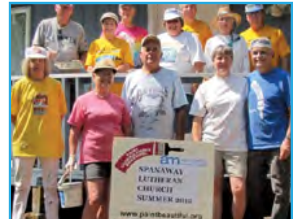
The Painting Crew