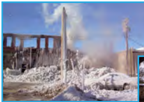
Three examples, fire, water, wind, of disasters in Washington State that amounted to extensive damages to property and lives.

Associated Ministries' Disaster Response program mobilizes and engages people of faith to prepare for the event of a disaster and long-term recovery efforts.