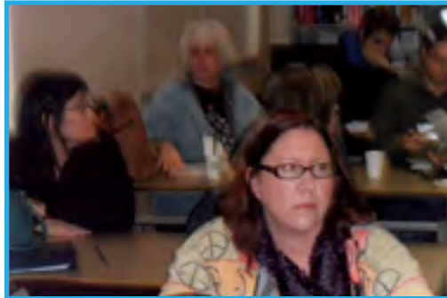
In class for training preparing for tax season.

The PCABC is a collaboration of 50 partners working to actively engage all of Pierce County residents in building prosperity through various programs.