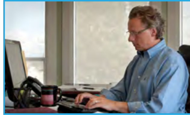
Our Leader hard at work.